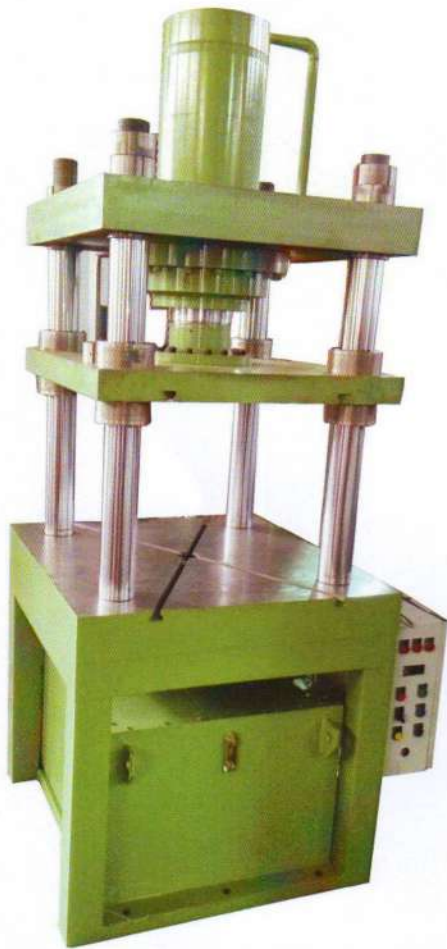
Pillar Type Hydraulic Press