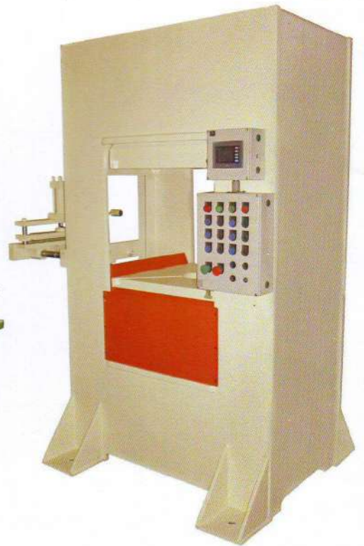
Four-Action Hydraulic Press