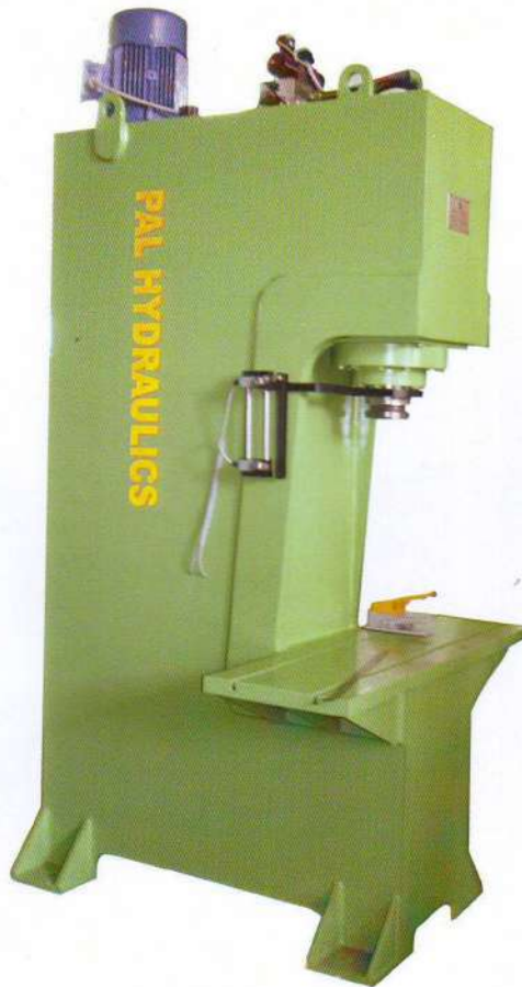
Electro Hydraulic Press