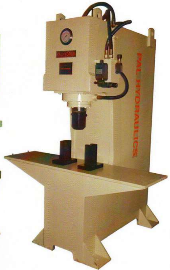
Straightening Hydraulic Press