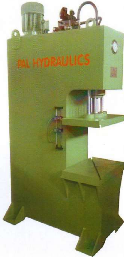
'C' Type Hydraulic Press