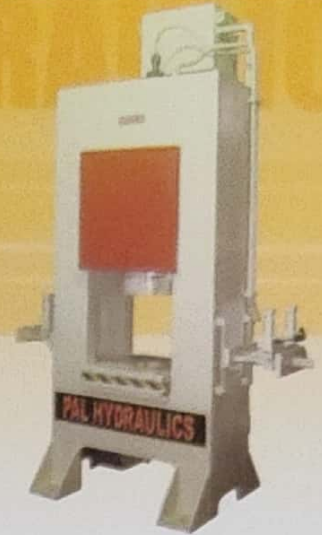
Hydraulic Triple Action Press