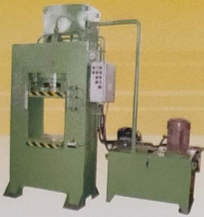
Hydraulic Cold & Hot Forging Press