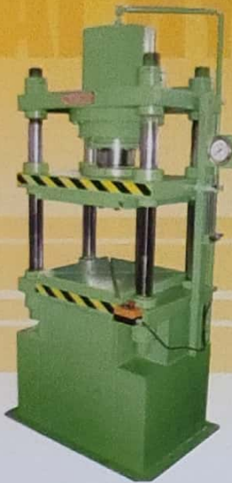
Four Pillar Hydraulic Press