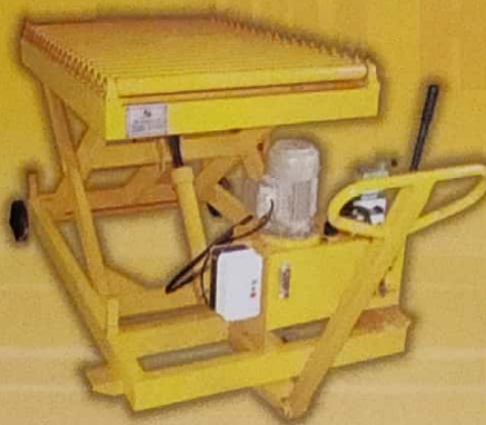
Hydraulic scissor Lifter