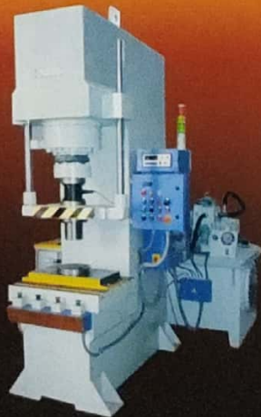
'C' Type Hydraulic Press