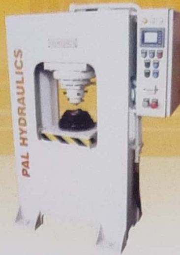
Hydraulic Ambossing Press