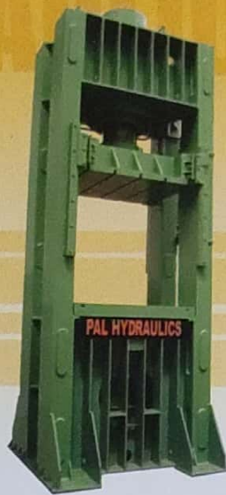
High Speed Deep Drawing Press