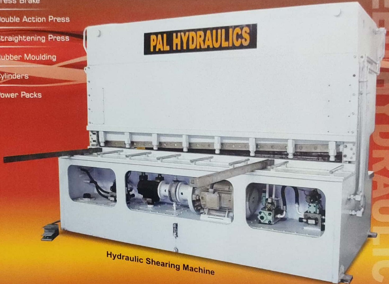
Hydraulic Shearing Machine